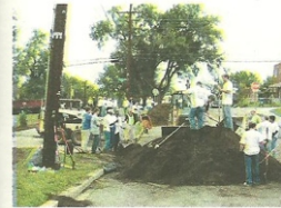
Volunteers at work on 42nd Street, September 12

On November 14, Groundwork Anacostia River DC will plant 25 trees with Casey Trees. Volunteers to help with the planting of Chestnut at Groundwork Anacostia River DC should email dchestn@casey.com, or call 202-638-1111.